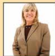
Health System Coordinator

Group Discount Allows Multiple Staff to Pursue Readmissions Certificates